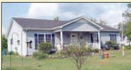
3904 DEERLICK ROAD LEWISBURG, KY

3 bedrooms, 2 full baths and 2 half baths, with a full basement only 4 years old, with a detached garage. This home is only minutes from Lake Malone. Call Dewayne for more info at 725-5670. Priced at $140,000. DW-420