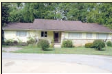
107 RESERVOIR DR. RUSSELLVILLE, KY

3 bedrooms, 2 full baths and 2 half baths, with a full basement only 4 years old, with a detached garage. This home is only minutes from Lake Malone. Call Dewayne for more info at 725-5670. Priced at $140,000. DW-420